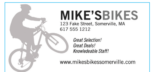
Ad without Bleeds