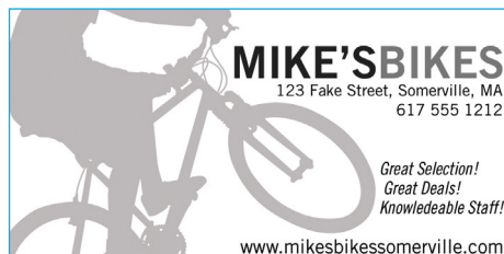
Ad with Bleeds

If the ad you've selected includes this, please leave an area of .625"x.625" somewhere in your artwork for the map number designation.